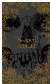
WHAT IS HIDDEN