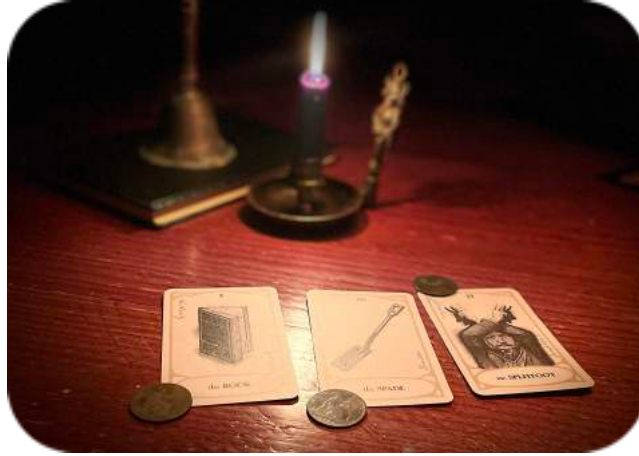
The Wishing Well